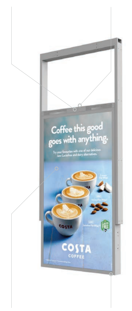
SMART TEMPERATURE CONTROL